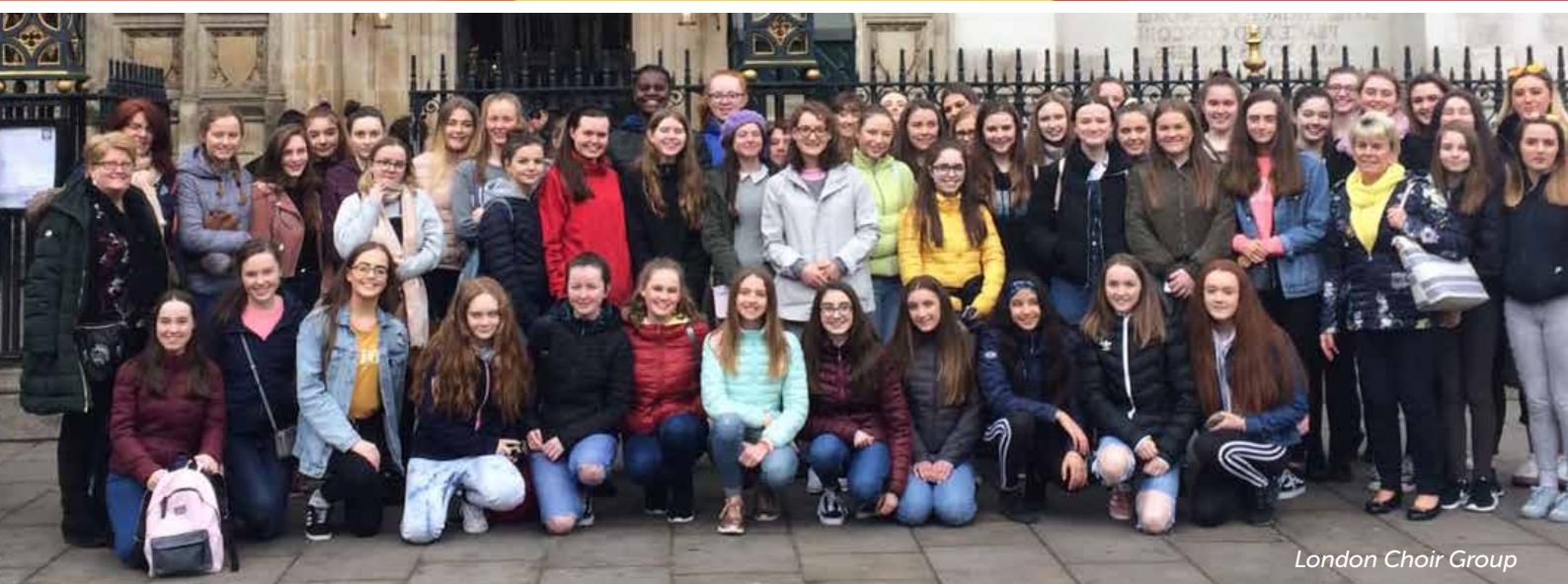
London Choir Group