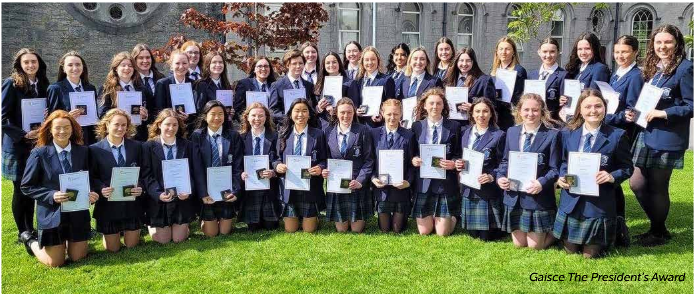
Gaisce The President's Award