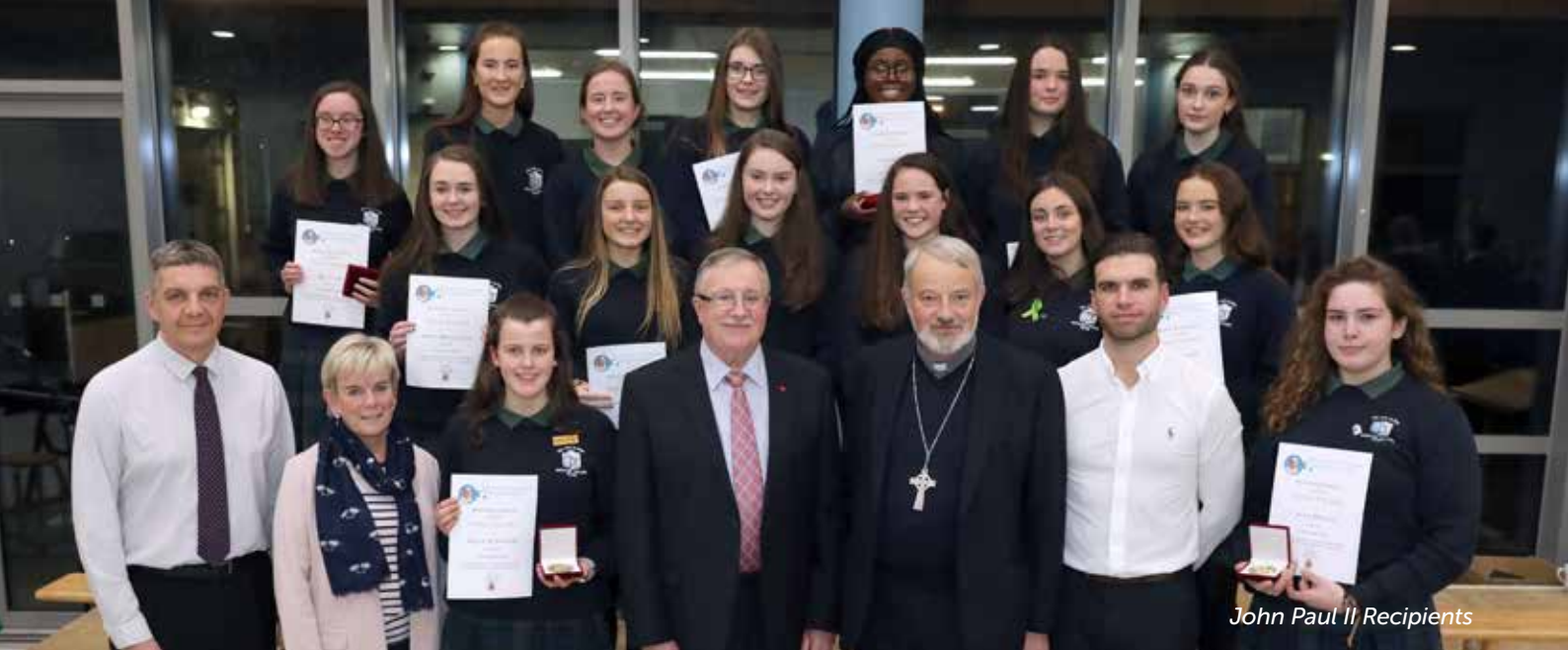
John Paul II Recipients