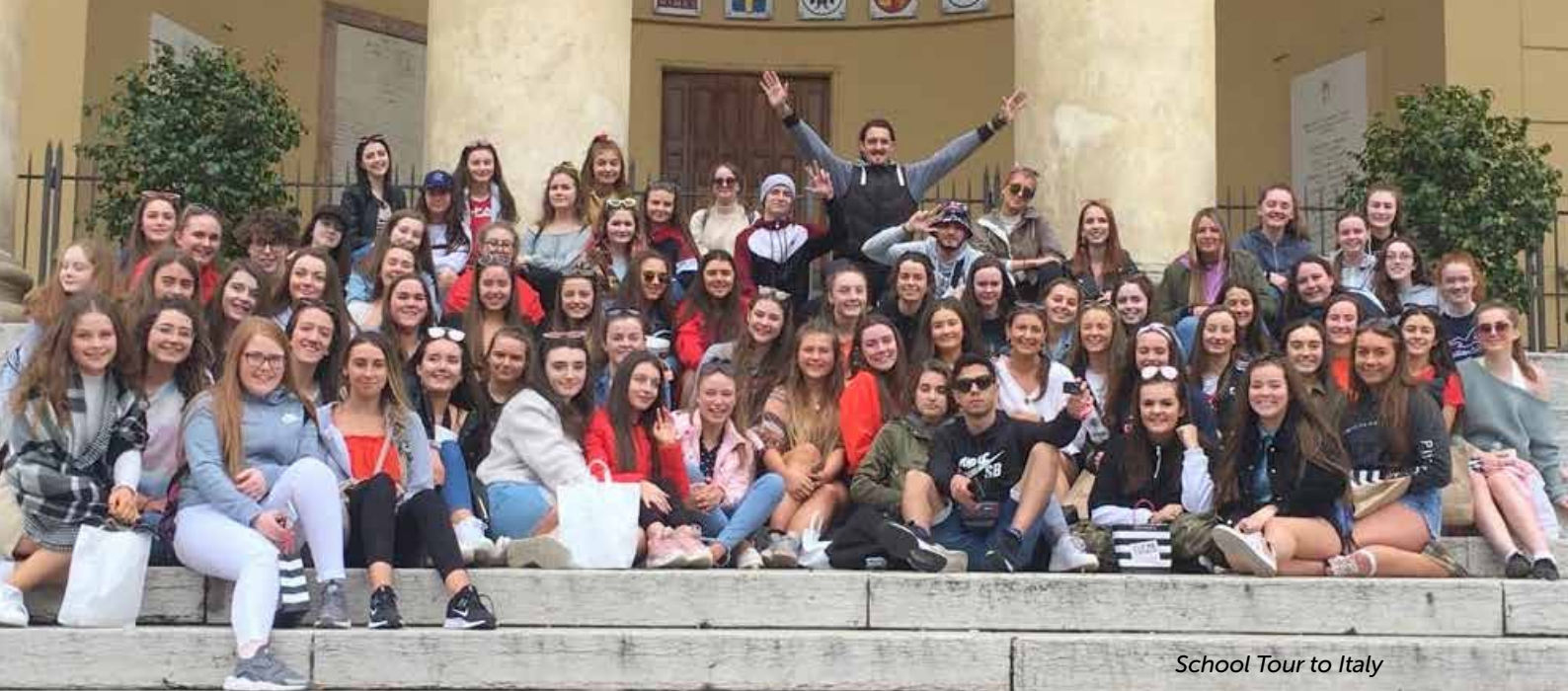
School Tour to Italy