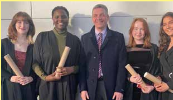
Students who received 7 H1's

has a broad and very comprehensive range of subjects available at both junior and senior level which helps students at all levels to achieve their unique potential.